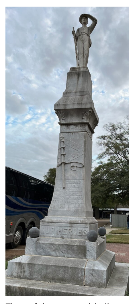
The confederate memorial adjacent to the courthouse door in Tallahatchie County, Mississippi.

1944, the family moved to Money, Mississippi where Wheeler's dad found work as a sharecropper on a cotton plantation. Although sharecroppers were paid for each bag of cotton they picked, the overseers count was often manipulated so that the sharecroppers never had more than enough to pay for the items they really needed. The life of a sharecropper was not much better than that of a slave.