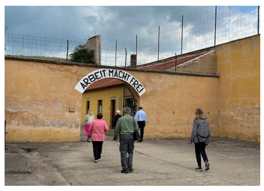
The infamous "Work Sets You Free" sign above the entrance to the Small Fortress.

of this pedagogy is prominently on display.